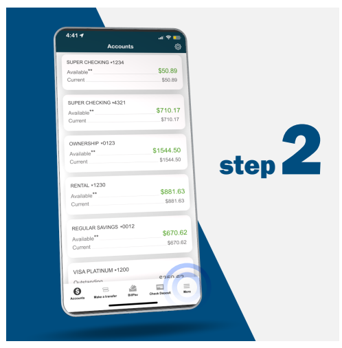
FROM YOUR ACCOUNTS PAGE SELECT "MORE".