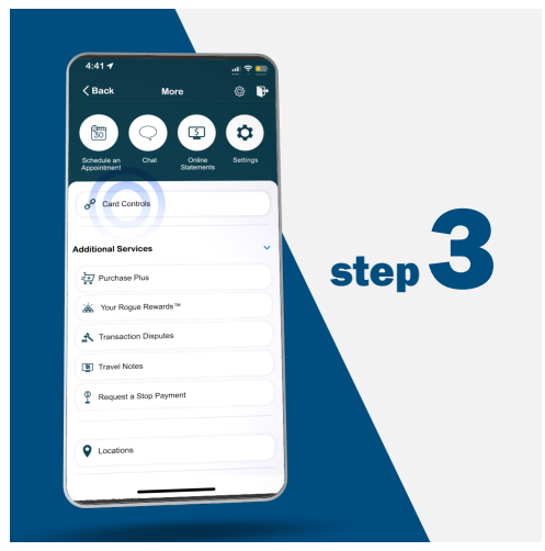
FIND "CARD CONTROLS" AT THE TOP OF THE LIST.